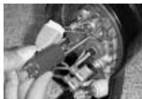
Figure 27 (External Power Supply) Removing lamp